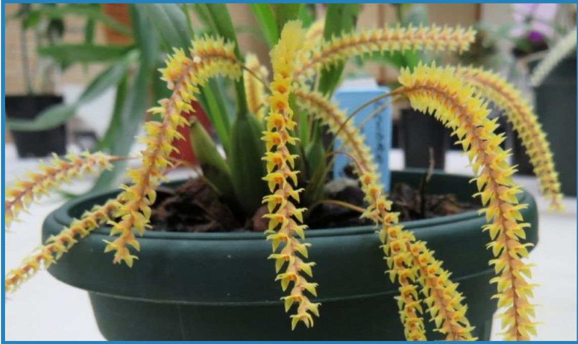
Dendrochilum clowesii grown by Mike Hitchcock

Disclaimer: The growing guides are provided only as a starting basis to cultivation. Local conditions in your area may require modification to these suggestions. SSOS will not be responsible for the results of your cultivation practices. The opinions expressed in these articles are those of the author and not those of SSOS, SSOS in no way endorses or supports any claims or opinions of said authors. Pictures provided by Pamela Davies and Richard Dimon and may not be used without the expressed permission of the photographer.