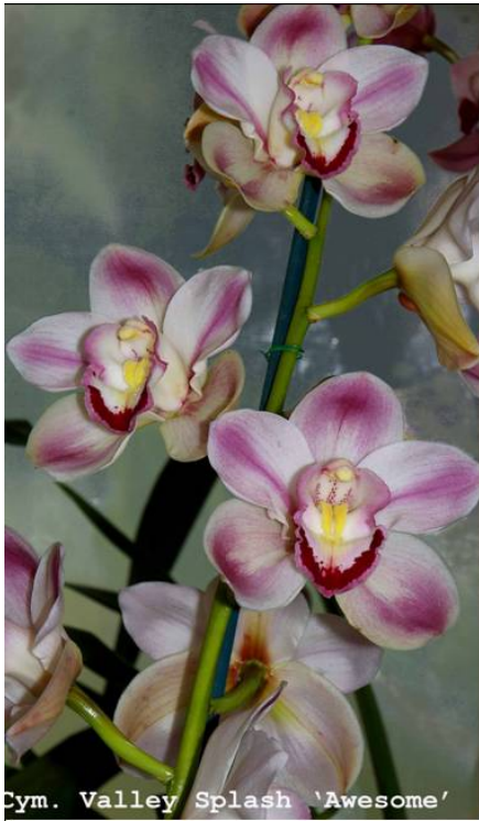
Cym. Valley Splash 'Awesome'