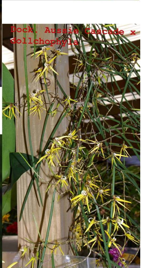
Dock. Aussie Cascade x Gollchophyla