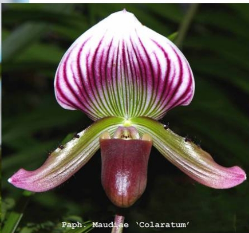
Paph. Maudslayi 'Colaratum'